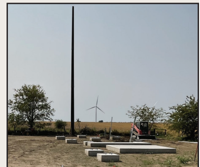
Corning substation foundations

Southwest Iowa REC was also tasked with several substation projects to be completed in the next couple years. These projects are a result of our power provider (CIPCO) needing to upgrade the incoming voltage to our subs from 34.5KV to 69KV. Upgrading the voltage provides increased capacity and better reliability. CIPCO also needs to upgrade a few of their own substations and many miles of lines to accommodate the larger conductor and larger clearances needed for the higher voltage. This means that the lines will be more robust and should result in less outage time for our members. With this upgrade, Southwest Iowa REC will be retrofitting in two substations (Carbon and Bluegrass), a replacement transformer in our Stanton substation and a complete rebuild of the Corning substation. Work began on the Corning substation in late spring this year. Contractors are completing the foundation work, grading and the installation of the fence while the rest of the substation build will be completed in house by our own crews. The plan is to have the new substation, and the upgrades completed before the voltage conversion by CIPCO in the spring of 2026.